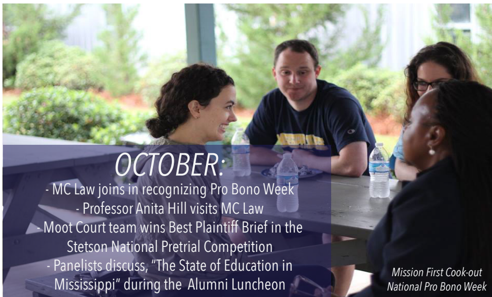
Mission First Cook-out National Pro Bono Week

- MC Law joins in recognizing Pro Bono Week - Professor Anita Hill visits MC Law - Moot Court team wins Best Plaintiff Brief in the Stetson National Pretrial Competition - Panelists discuss, "The State of Education in Mississippi" during the Alumni Luncheon